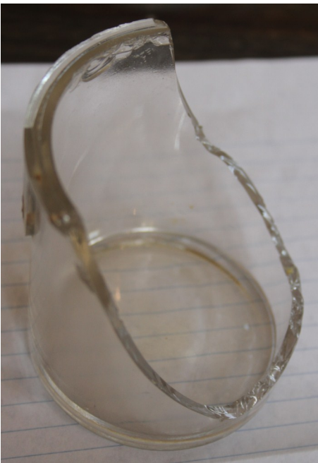
This is the remains of Lou's Domestic jar