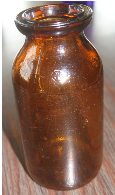
Mike Mosier displayed this attractive amber wax sealer (hard to see crack)