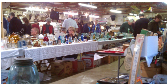
Show Room Floor at the Auction Barn in Findlay, Ohio