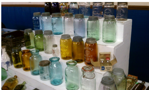
Ed Kincheloe had many nice jars for sale