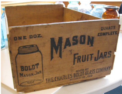
First and only known example of a Charles Boldt Glass Company wooden shipping box