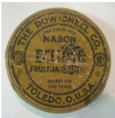
Round Eclipse Fruit Jar Rings box