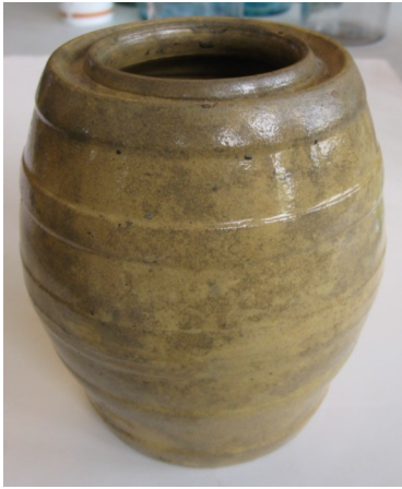
Quart wax sealer pottery jar