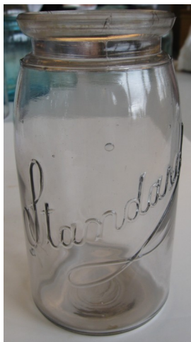
SCA quart Standard with looped underscore