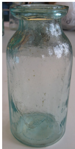
Crude aqua quart wax sealer