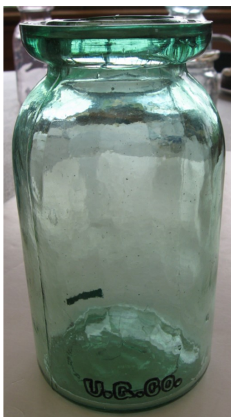
Green quart U.G.Co. jar