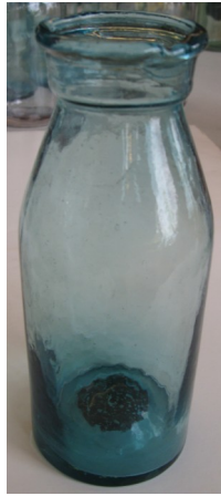
Deep aqua, pontiled quart jar