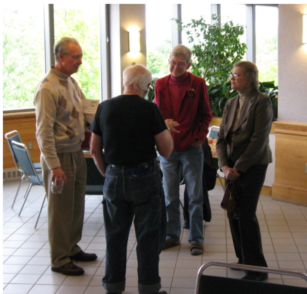
Club members enjoy a lively discussion during the Oct. meeting