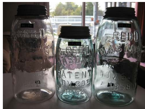
Redkey jars: clear HG; aqua QT; aqua HG