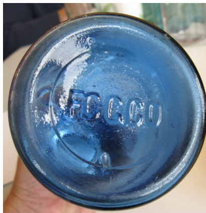
Base of the cobalt blue jar