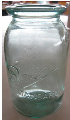
Aqua quart Ball (3-L) Standard