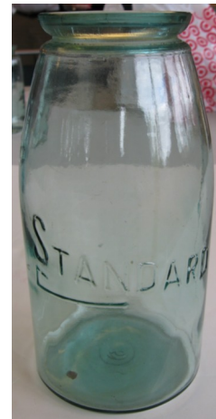
Green half gallon Standard with shepherd's crook