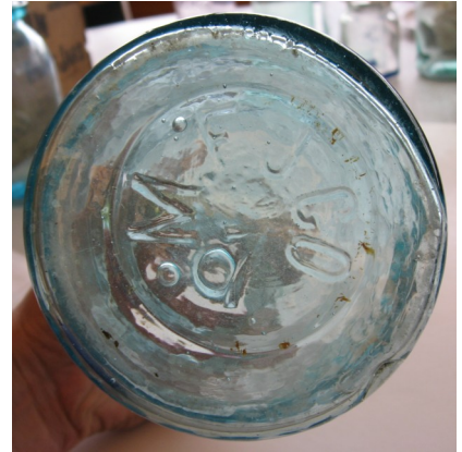
Aqua quart Marion Fruit Jar Company