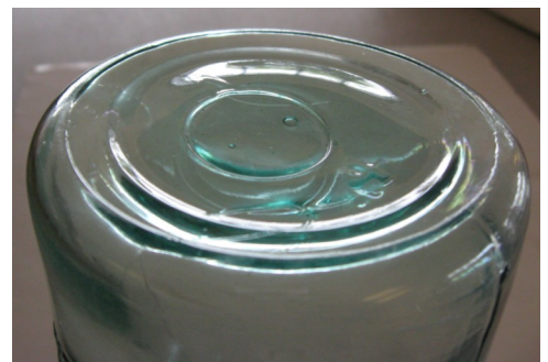
Base of the Ball Standard. It is unusual because it is "cupped" (large recessed area).