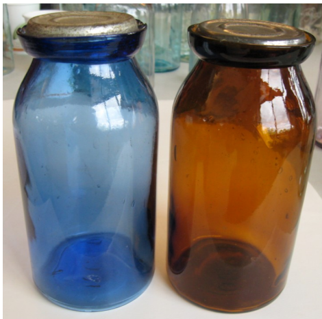
Cobalt blue & Amber quart FCGCo jars