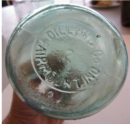
Aqua quart Dillon Glass Company