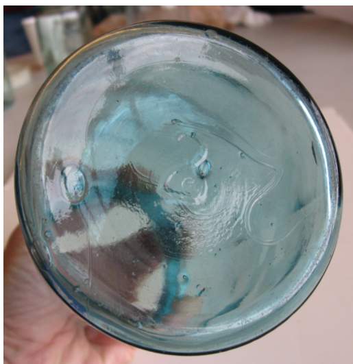
Base of the unembossed Ball blue jar—was it made on a Ball-Bingham machine? Looks very similar!