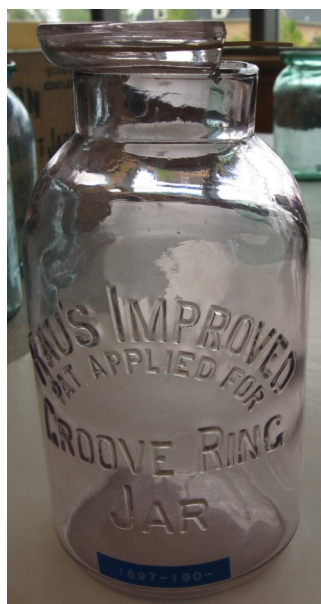
Light purple Rau's Improved quart jar with wax sealing ring section cut out for studying