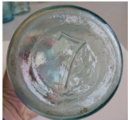
Base of the crude jar has a large 7