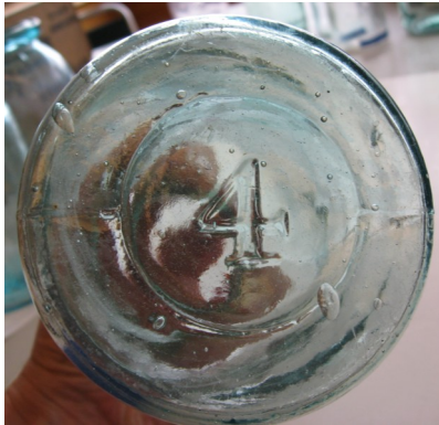
Aqua quart with Hemingray 4