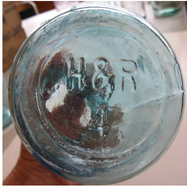
Aqua quart Hollweg & Reese