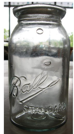
Almost clear Ball (3-L) Standard (some tint of aqua in base)