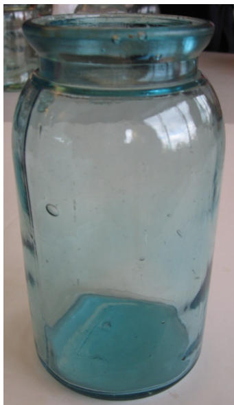
Unembossed quart Ball blue machine-made wax sealer (same general style as a Ball Standard!)