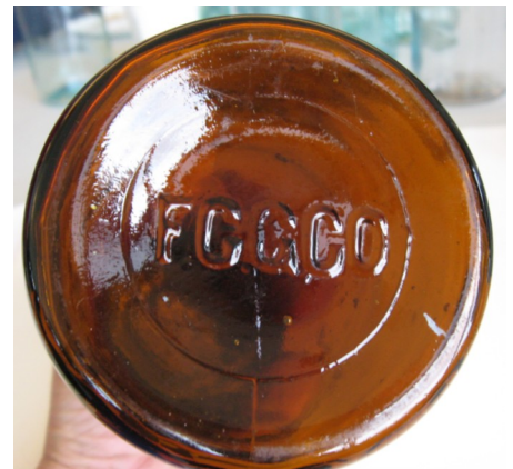
Base of the amber jar