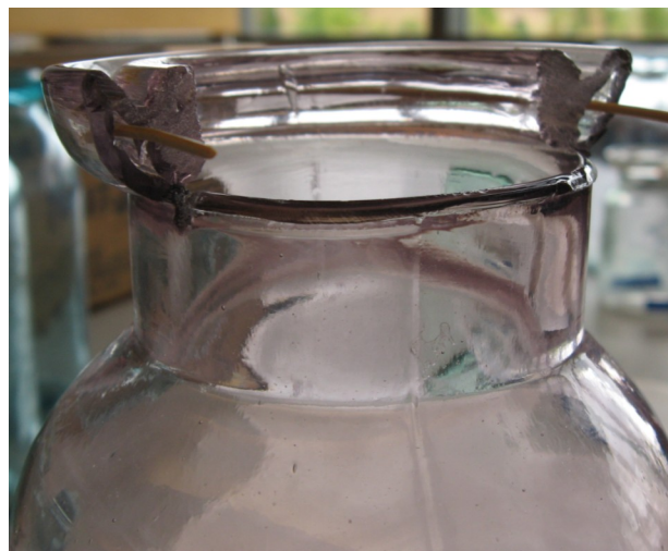
Close-up of the cut away sealing ring. This jar was machine-made and had a hollow channel inside the ring. The wires sticking out of the inner channel in the photo illustrate the hollow area.