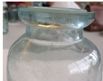
Look at the crooked applied top on this light aqua unembossed quart jar!