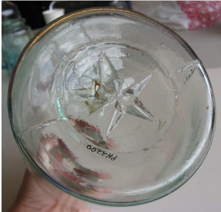
Aqua quart wax sealer with large Star