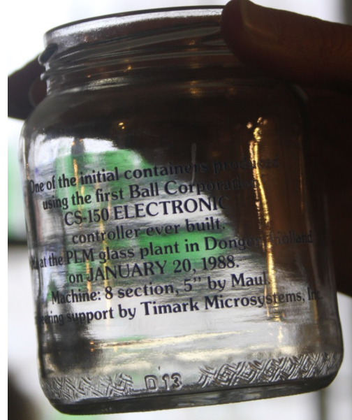
Clear jar; "One of the initial containers produced using the first Ball Corporation CS-150 Electronic controller ever built."