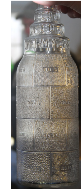
A clear sample bottle with stippling examples made by Overmyer Mould Co.