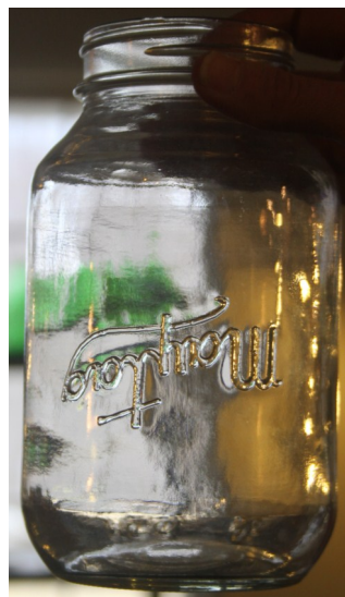
Clear quart jar with upside down "Maytag"; heel embossed "M.C.C. 98"