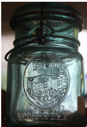
Ball blue pint commemorating new Ball headquarters in Muncie in 1976