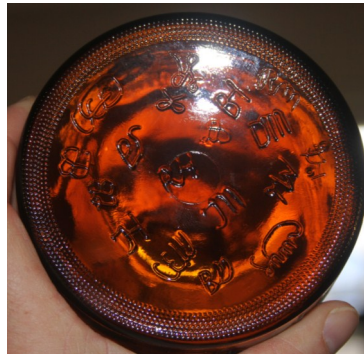
Same bottle with a base showing many initials of people