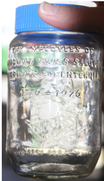
Both sides of clear jar commemorating the U.S. Bicentennial; One side has the design of an early glass gaffer; The other side said "The Employees of Brockway Glass Salute America's Bicentennial 1776-1976"