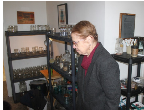
There were multiple rooms of Ball collectibles to browse in the house