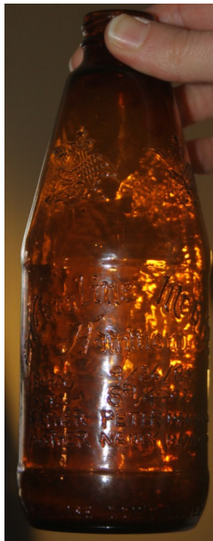
Both sides of amber bottle commemorating the birth of a baby 9/26/84; picture of baby