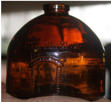
Amber bottle made in the shape of a glass "day tank" furnace