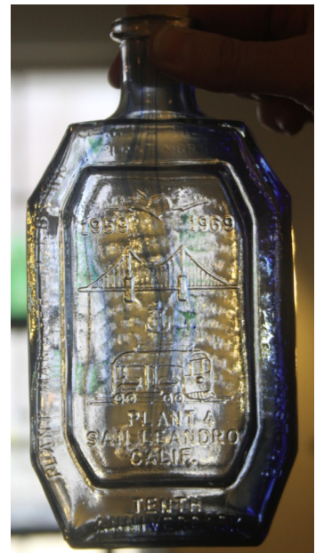
Two different colors (green and clear with cobalt streaks) of a bottle commemorating the tenth anniversary of Anchor Hocking "Plant 4 San Leandro Calif."