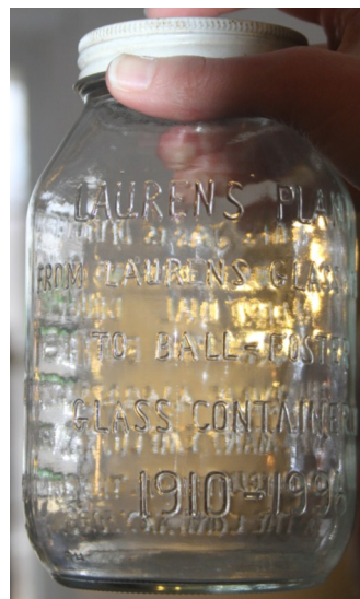
Clear quart jar commemorating "Laurens Plant From Laurens Glass Works to Ball-Foster Glass Containers 1910-1996"; "This jar is dedicated to the founders of LGW"