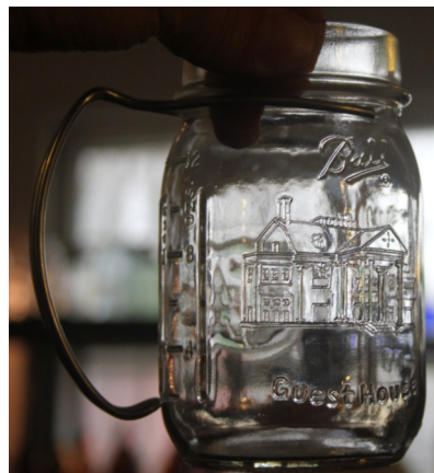
Clear pint with figure of the Ball Guest House in Muncie, Indiana (shown with wire mug handle)