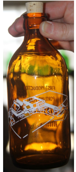
Both sides of amber bottle commemorating "First Production Portland Plant Owens-Illinois August 9, 1956" (design of the glass plant)