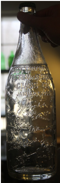
Clear bottle "Sales Conference Foster-Forbes Glass Co. January 1955"