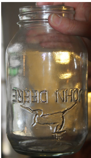
Clear quart jar with upside down "John Deere", and upside down figure of a deer