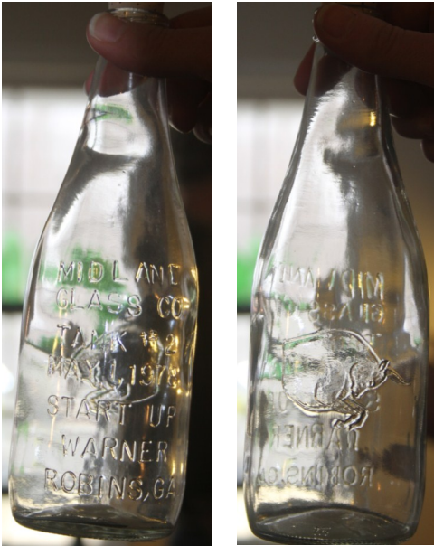
Both sides of clear bottle commemorating "Midland Glass Co. Tank # 2 May 1, 1978 Start Up Warner Robins, GA"; bull design