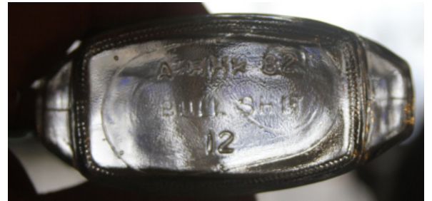
One variation of the clear bottle above has the phrase "Bull Shit" embossed on the base