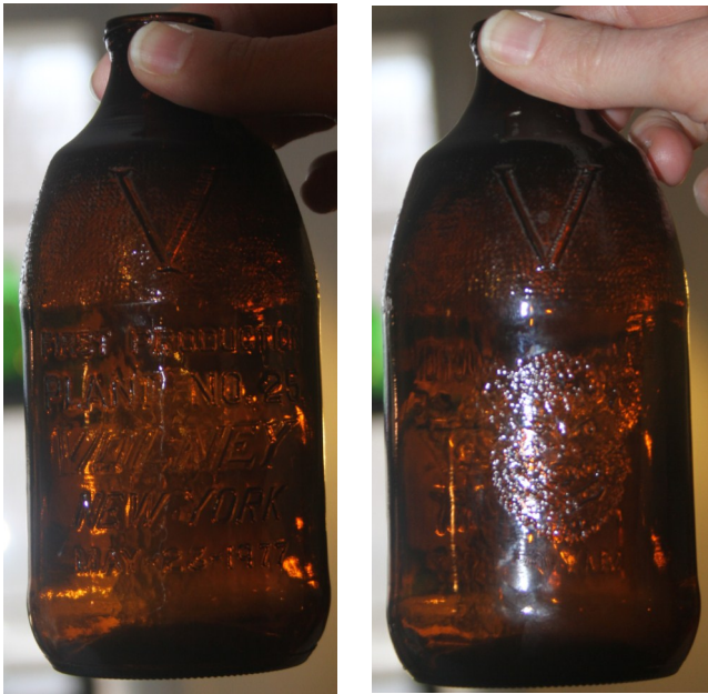
Both sides of amber bottle commemorating "First Production Plant No. 25 Volney New York May-23- 1977"; figure of a bear's head