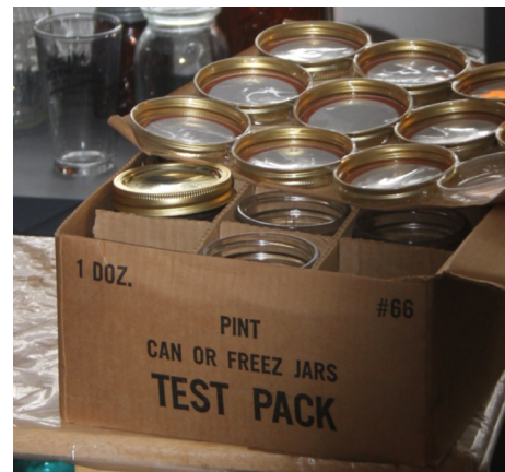
This original box of clear pint Ball ® Mason jars (with sculptured fruit design) has the word "Test Pack" on the side