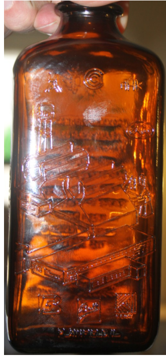
Both sides of amber bottle commemorating the Plainfield glass plant 1956 to 1996 (design of factory and several company logos)