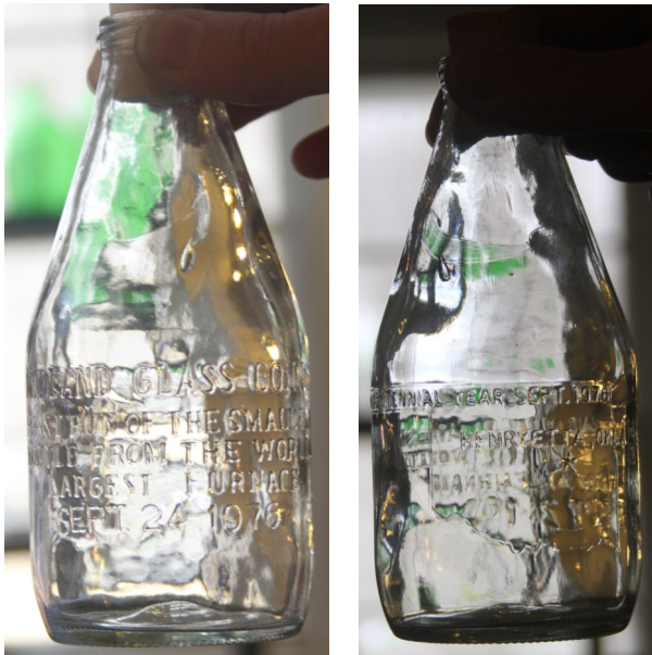
Both sides of clear bottle commemorating "Midland Glass Co. First Run of the Smallest Bottle from the World's Largest Furnace Sept. 24 1976"; "Henryetta, Okla"