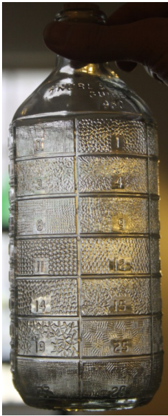
Clear bottle embossed "Knurl & Stipple Guide" with various numbered examples of knurling and stippling around the bottle