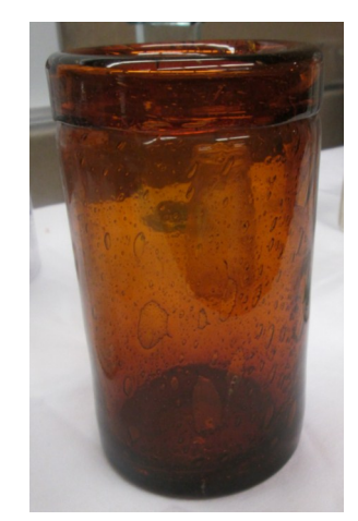
Amber quart with lots of bubbles and large lip