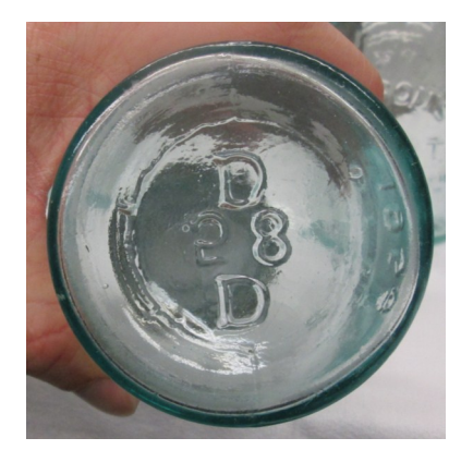
Aqua midget pint Mason's Patent Nov 30<sup>™</sup> 1858; base D 58 D