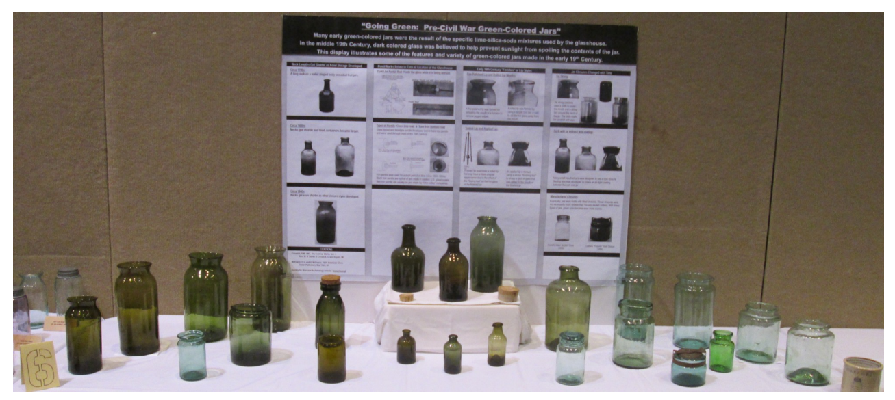
Tom Sproat's display was titled "Going Green: Pre-Civil War Green-Colored Jars"