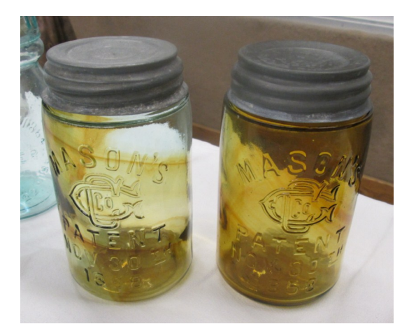
Pair of amber swirled pint Mason's GCCo Patent Nov. 30<sup>TH</sup> 1858