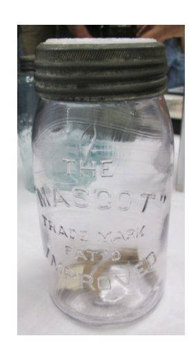
Clear swirled glass quart The "Mascot"