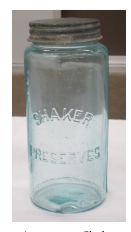
Aqua quart Shaker Preserves