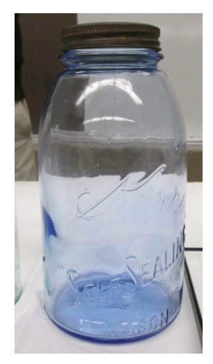
Cornflower blue half gallon Kerr "Self Sealing" Mason