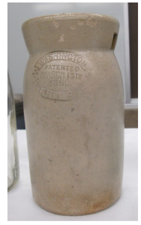
Quart Washington Fruit Jar Patented March 13<sup>™</sup> 1866