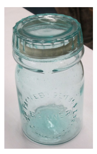
Aqua pint Banner