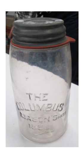
Clear quart The Columbus Mason's Patd 1858