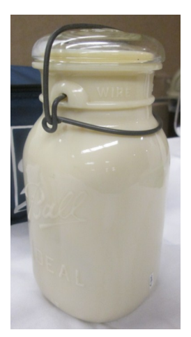
Milk glass quart Ball Ideal test jar