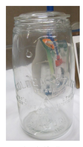
Clear half gallon Golden–State