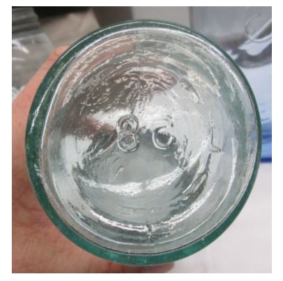
Aqua midget pint Mason's Patent Nov 30<sup>™</sup> 1858; base 58