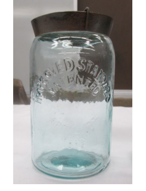
Aqua quart Improved Standard Patented