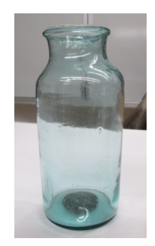
Aqua tooled lip jar with iron pontil