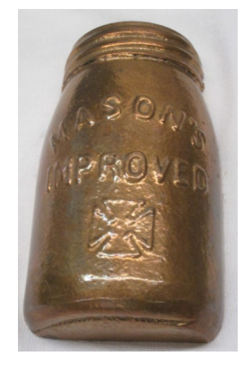
Metal paperweight of Mason's Improved (cross)