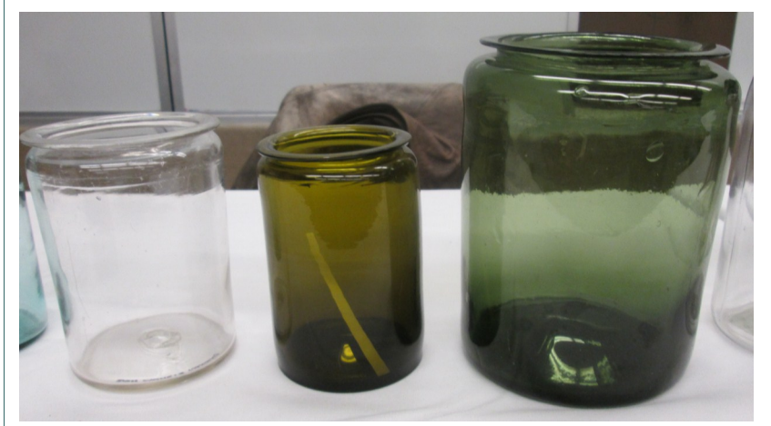
A clear and deep olive pint and deep green quart with flared lip and glass pontil (string tie closure)