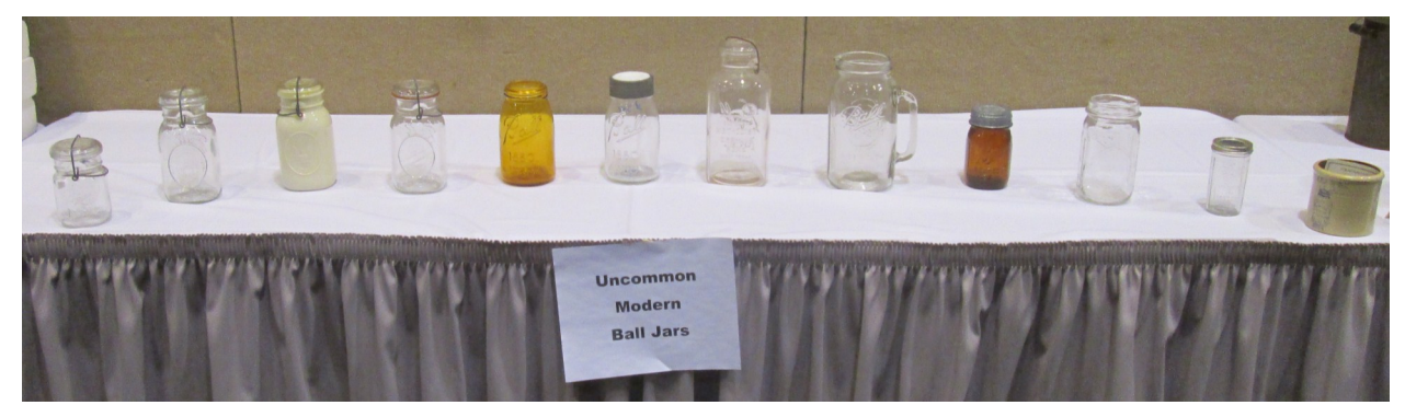
Dick Cole displayed Uncommon Modern Ball Jars