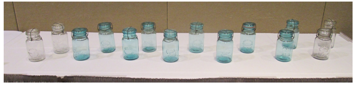
This was a display on Show Day of quart "slug plate" jars made for various companies by Ball Brothers