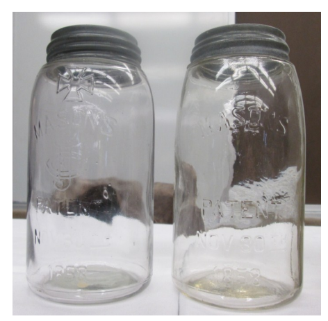
Clear quart Mason's Patent Nov 30<sup>™</sup> 1858 with and without Cross and CFJCo