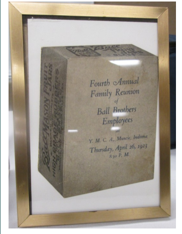
Invitation to Fourth Ball Brothers Employee Reunion 1923