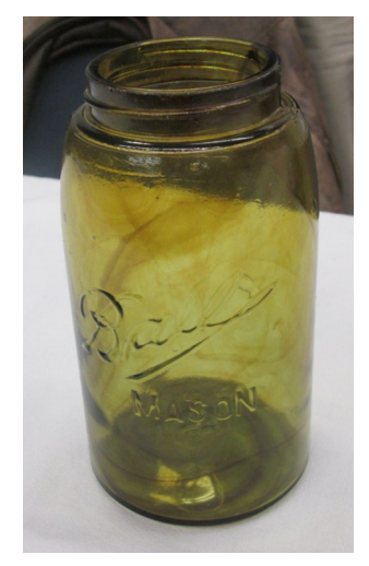
Olive with amber swirls quart Ball (3L) Mason