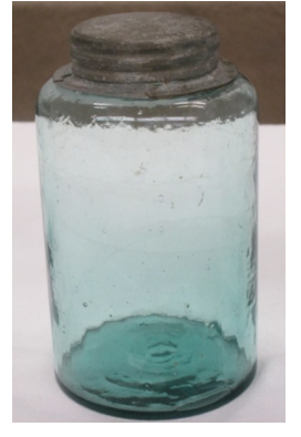
Deep aqua pint Hemingray with flared cap