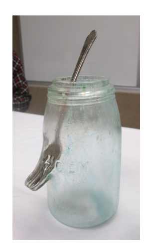
Aqua quart Gem modified to hold a fork