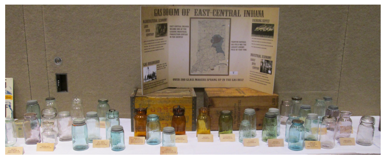
A nice display covering the Gas Boom of East-Central Indiana