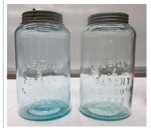
Aqua quart "Crowleytown" Masons