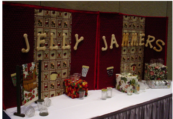
Jelly Jammers Club Display