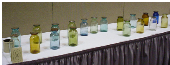
Ron Hands' Display "Wax Sealers"