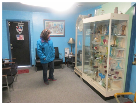
Even the lobby at NSA Security Agency contains many glass items on display