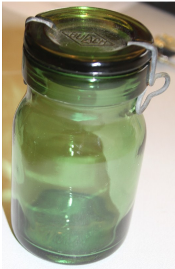
Emerald green pint Bulach (in diamond on glass lid); Made in Switzerland; brought by Colleen Dixon