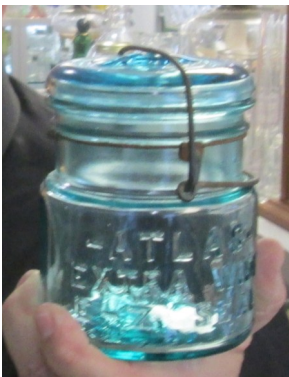
Rare deep aqua pint "Atlas Extra Wide E-Z Seal"