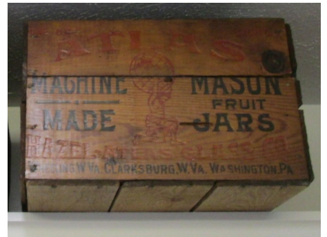
Wooden shipping boxes are very hard to come by and this example is in very good condition