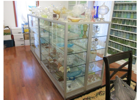
The attractive and professional display cases sitting along the center of the display room were shipped from Canada