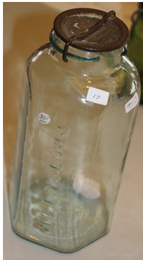
Aqua half gallon Protector with original closure; brought by Colleen Dixon