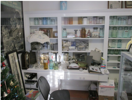
One corner of the display room has a built-in desk and drawers, which is a nice place to study the materials in the collection