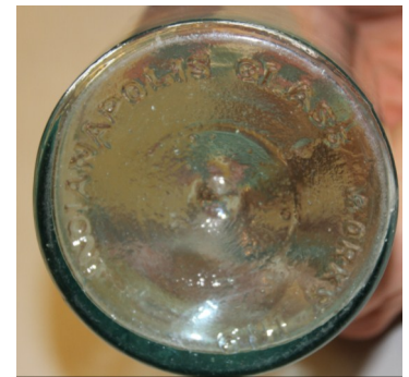
Aqua quart wax sealer (base: Indianapolis Glass Works); brought by Monty Foust