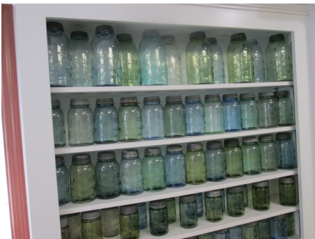
These shelves represent the complete rainbow of Atlas Strong Shoulder Mason jars; there are quite a few color variations