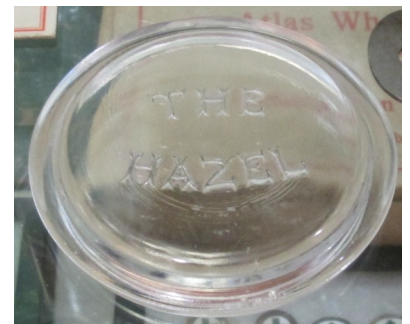
Rare clear lid "The Hazel"