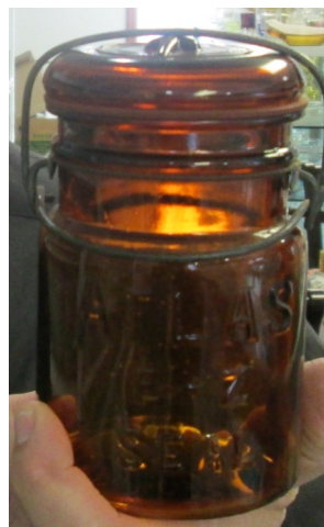
Rare amber pint "Atlas E-Z Seal"