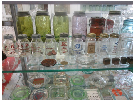
A very rare collection of the Atlas coin banks can be seen in this display case; I had never seen most of these before