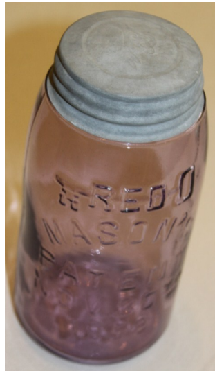
Purple quart RED (key) Mason's Patent Nov 30 th 1858