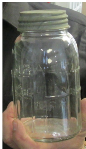
Rare clear quart HA gripper ribs Atlas Strong Shoulder