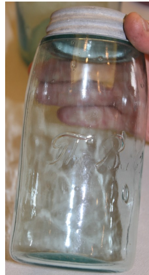
The Ball (shoulder seal); brought by Monty Foust