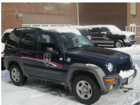
One of the NSA Security Agency fleet vehicles in the company parking lot