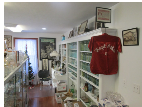
The perimeter of the display room is wall-to-wall white shelves full of Atlas jars; an old-time company baseball jersey hangs on one end