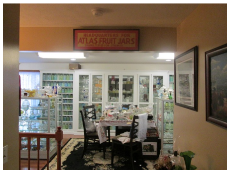
A framed original advertisement sign hangs above the entrance to the display room, "Headquarters for Atlas Fruit Jars—Double Tested for Strength"