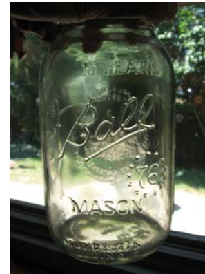
15 Years Mundelein Illinois