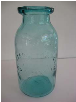
Darker aqua Star Glass Co.