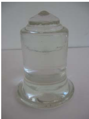
Glass solid-pour whats-it?