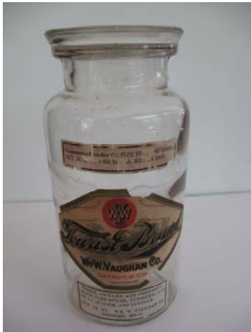
Tourist Brand—takes a Shies lid