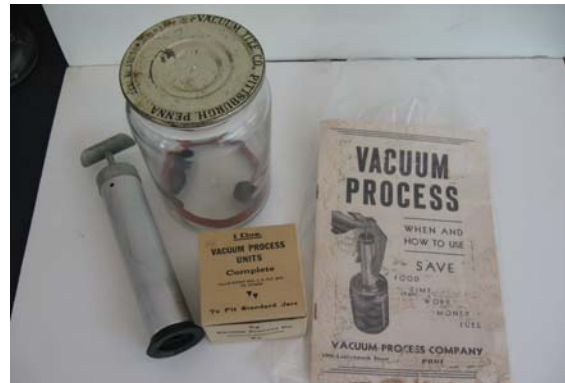
Complete kit for the Vacuum Tite Jar