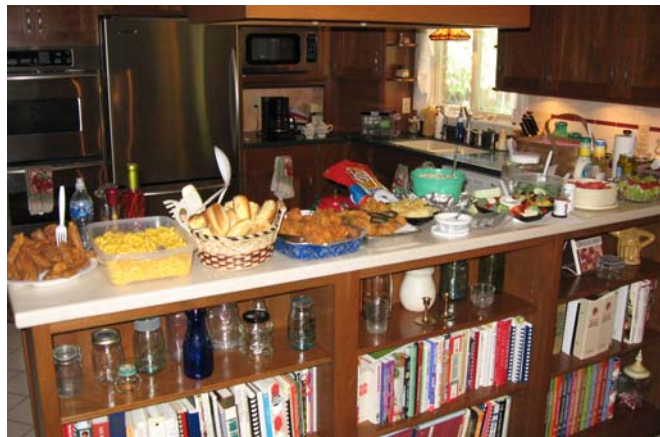
A wonderful buffet of picnic food including chicken and rolls