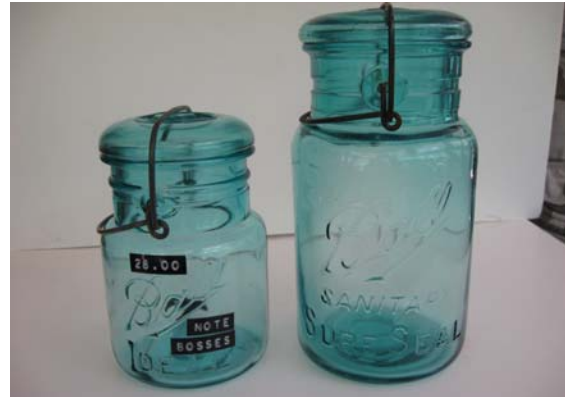
“Experimental Dimples” make Joe smile