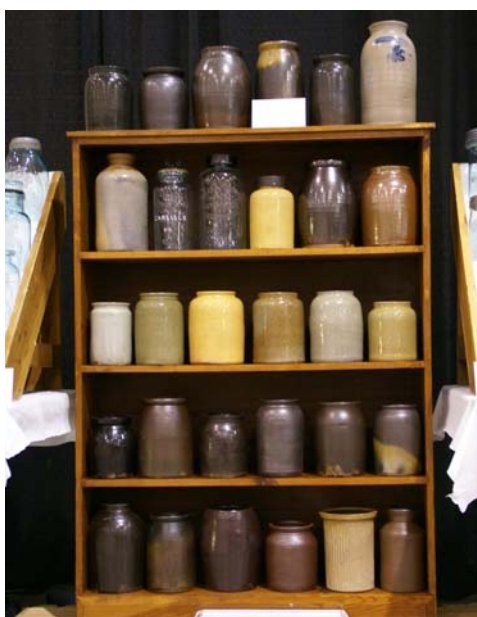
Pennsylvania Canning Jars