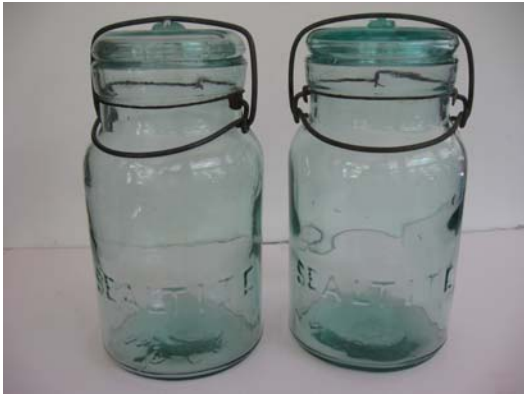
Seeing double—two scarce aqua SEALTITE jars