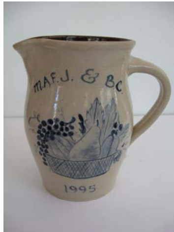
Exhibitor's Award Jar from 1995