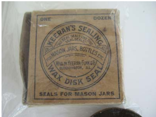
No Seal Seals Like Keeran's Seal Seals!