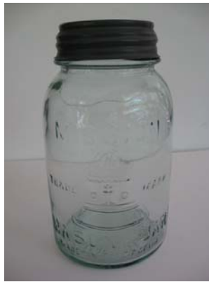
Mission (bell) Mason Jar