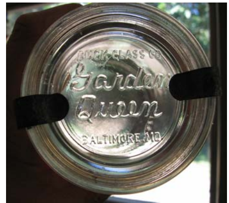
Buck Glass Co., Garden Queen