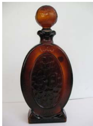
50 Years Overmyer Mould Co.