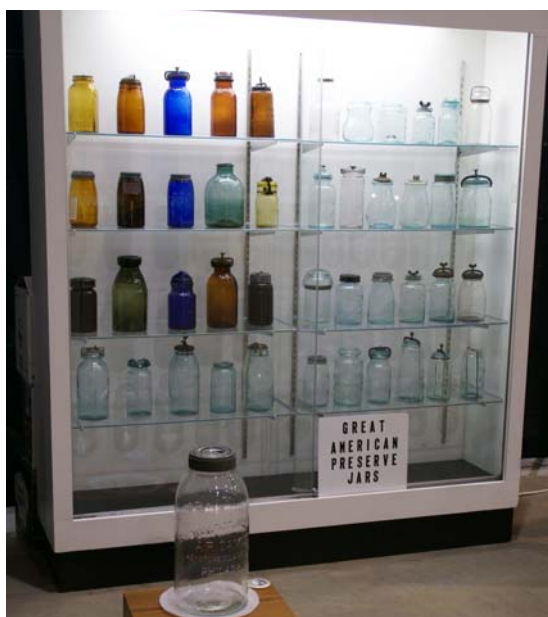
Great American Preserve Jars

Yes, we remembered the open sided cattle barns, where the dealers set up, and where some of the odor still lingered