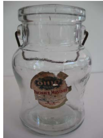
One Pint Sanitary Bucket w/ label