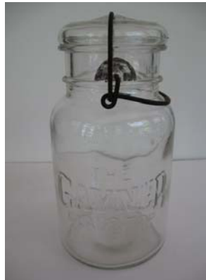
The Gaynor Glass-Top