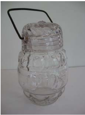
Pint-size mustard jar