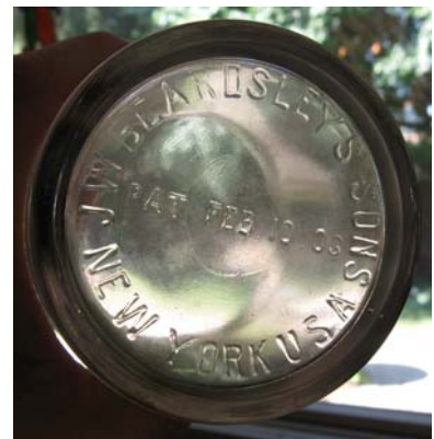
J W BEARDSLEY S SONS jelly glass